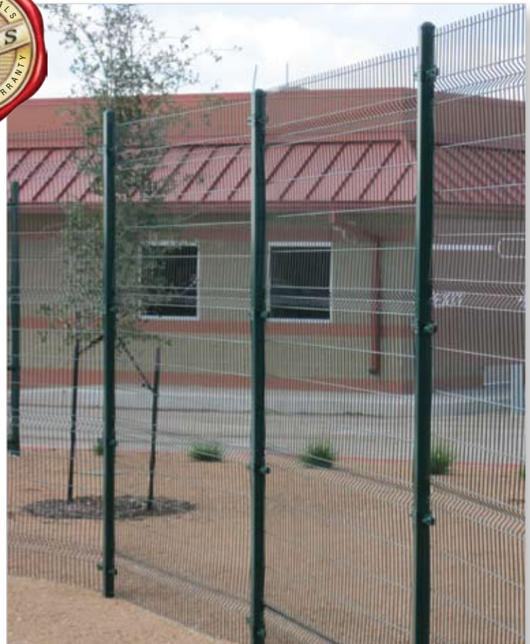
8 ft. Tuf-Grid® Welded Wire, Green